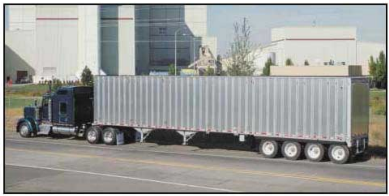
Aluminum Refuse Transfer Trailer

Whether you top, tamp, or compact load, you need a multi-axle refuse transfer trailer that works as hard as you do. That's why Reliance Transfers are engineered to perform in the most demanding operating environments. When your application needs the lightest weight aluminum refuse transfer trailers or the most durable steel refuse transfer trailers, Reliance Transfer Trailers provide the maximum payload and the weight savings you demand.