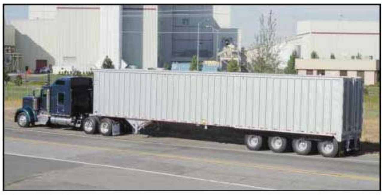
Steel Refuse Transfer Trailer